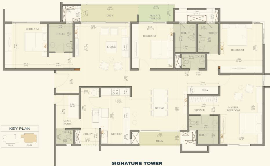
SIGNATURE TOWER TYPE - 4 BHK - Sig-(B10, B11, B16, B17, B22, B23) RERA CARPET AREA - 2108 Sq.ft PLINTH AREA - 2346 Sq.ft SALEABLE AREA - 3052 Sq.ft TERRACE AREA - 59 Sq.ft