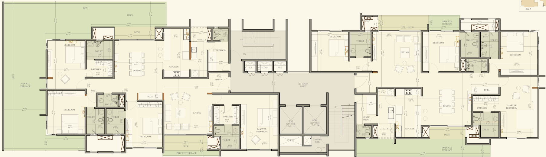
SIGNATURE TOWER LEVEL 5 UNITS WITH PRIVATE TERRACE (A&B)