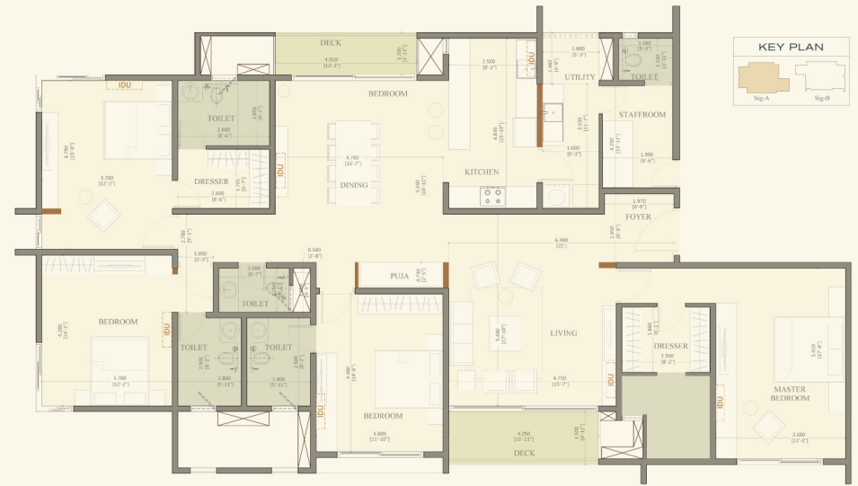
SIGNATURE TOWER TYPE - 4 BHK - Sig-A (Sig - A6 to A27) RERA CARPET AREA - 2193 Sq.ft PLINTH AREA - 2446 Sq.ft SALEABLE AREA - 3182 Sq.ft